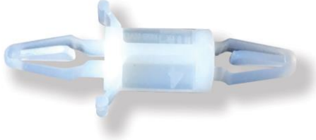
PCB - PLEXY