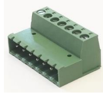
3,81 mm SKBK (11.161)